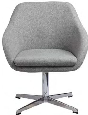
Johnny 1509 Felt Melange | Constant