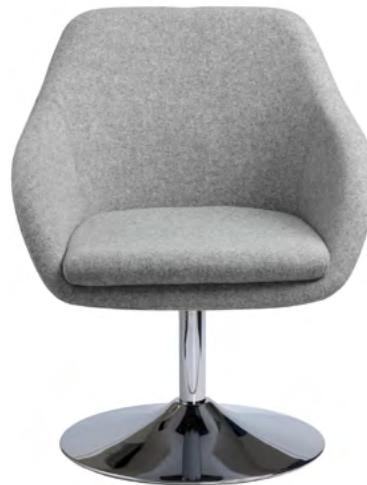
Johnny 1509-TP Felt Melange | Constant

Please visit www.nightingalechairs.com to explore our variety of textile options to help you personalize your Johnny chair.