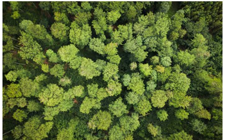
Climate — trees help cool the planet and capture harmful greenhouse gases