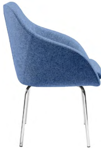
Johnny 1501 Faux Felt | Lagoon