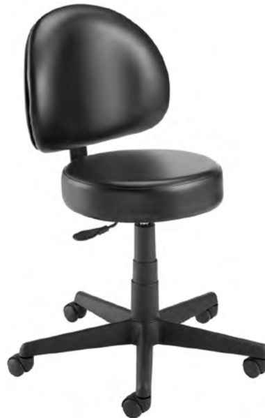
Stool with back Stool 1000WB Optional with sit to stand model with height adjustable foot ring