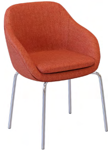
Johnny 1501 Continuum | Brick