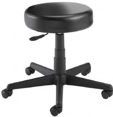
Standard Stool Stool 1000

All upholstered models shown in Standard Black Vinyl.