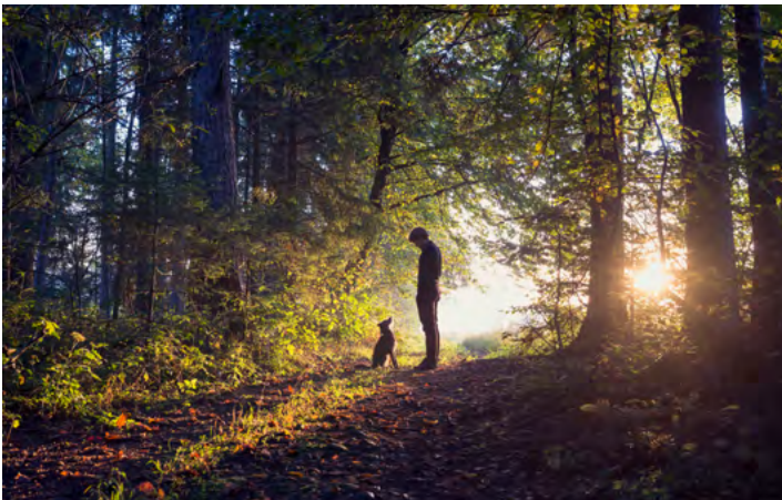
Health — trees reduce anxiety and stress, and allow us to reconnect with nature