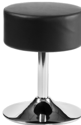
Stool with trumpet base Stool 1009