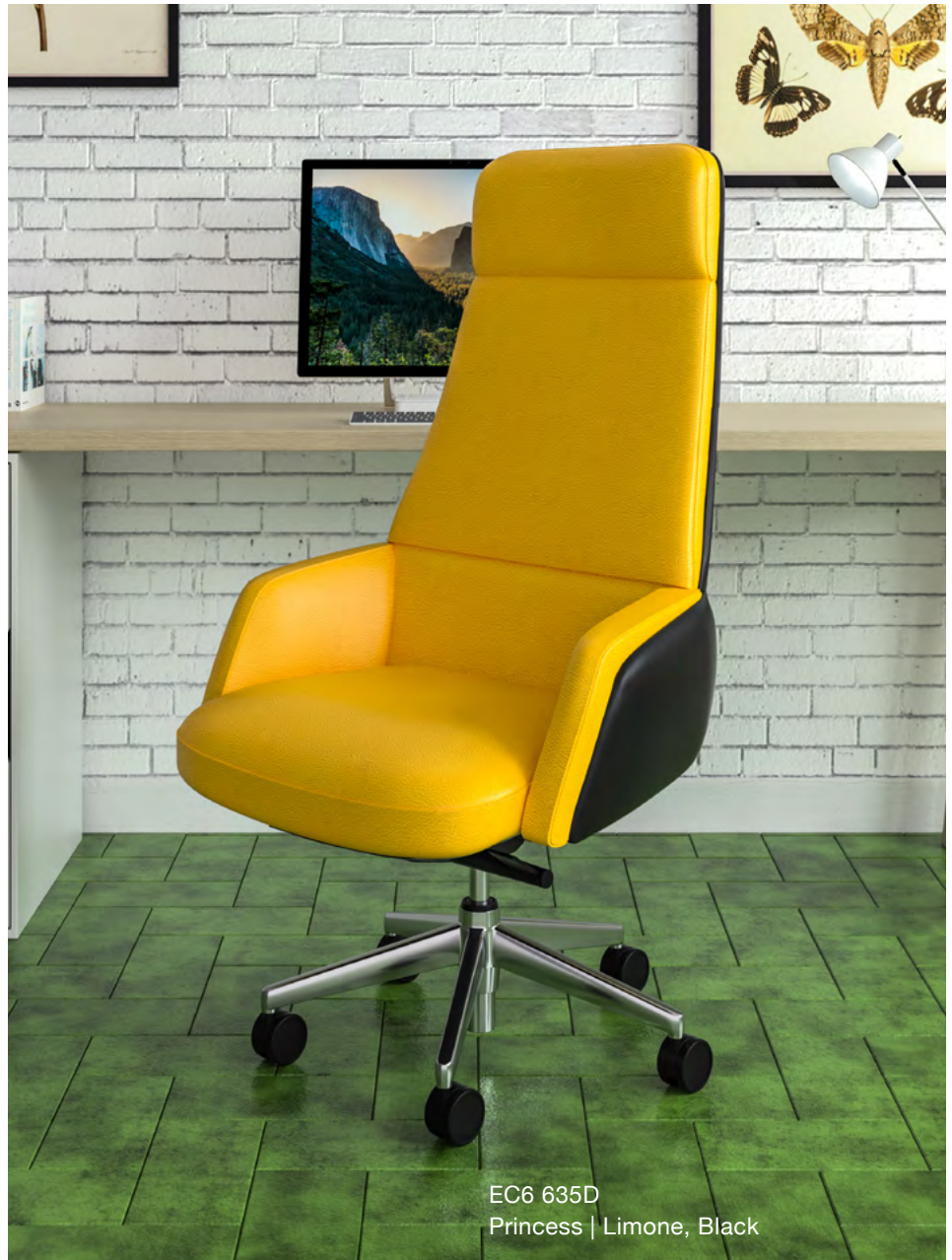
EC6 635D Princess | Limone, Black

If stain persists, use a mild soap and immediately dry any excess moisture. Never allow spills to set.