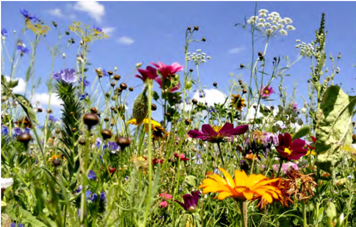
Biodiversity — a single tree can house hundreds of species of forest creatures including plants, mammals, insects, fungi, and moss