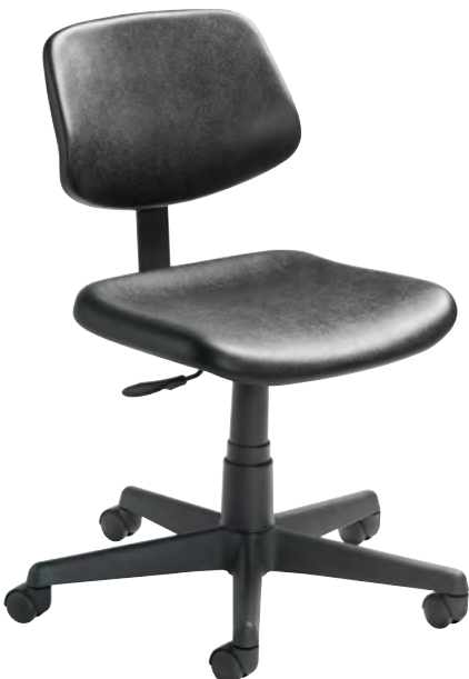
Polyurethane seat and back Stool 1010 Optional with sit to stand model with height adjustable foot ring