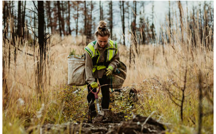
Social Impact — trees create endless job opportunities in the forestry industry, provide timber for shelter and heating needs, and produce food for both humans and animals