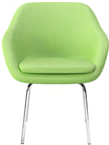
Johnny 1501 Continuum | Spring

This fully upholstered guest chair with high-density foam is perfect for general guest seating, individual contemplation, group work or conferencing. Now with three model options to choose from, the Johnny will fit the needs of any open-workspace and create a harmonious environment.