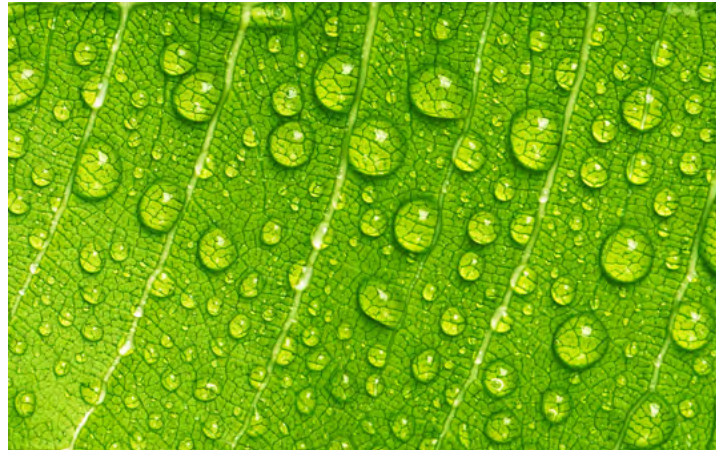
Water — trees capture rainwater reducing the risk of natural disasters